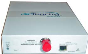
7 x 2 x 8 Indoor Enclosure

Power and data are supplied to the AT1504 via a Power-over-Ethernet injector using a standard CAT5 cable with RJ45 terminations that conveniently plug directly to the single 10/100 Base-T Ethernet interface.